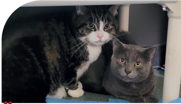
Ernest and Magellan

Sometimes, when cats need a little more time to adjust after arriving at the shelter, we place them in larger enclosures in a secluded, quiet room commonly known as "the Annexe."